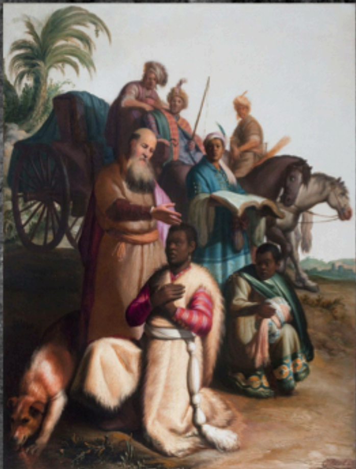
Rembrandt, The Baptism of the Eunuch , c. 1626