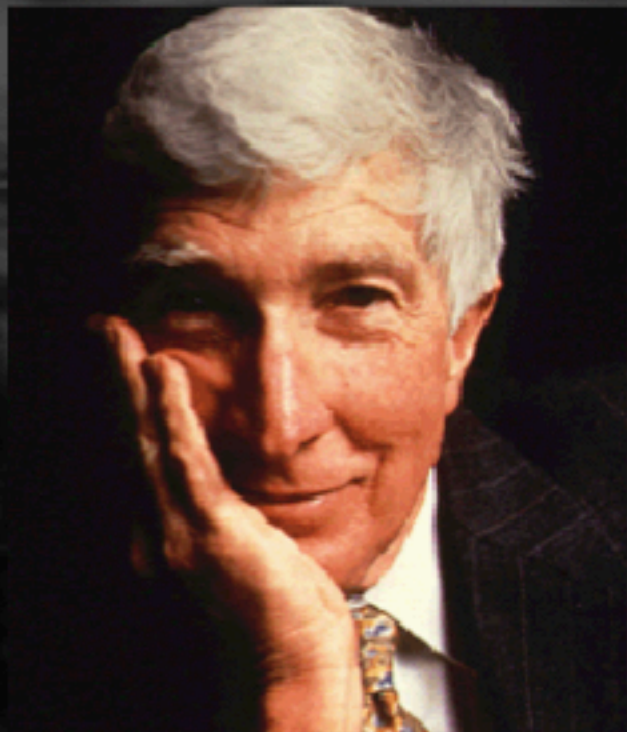
John Updike, "Hoeing"

I sometimes fear the younger generation will be deprived of the pleasures of hoeing; there is no knowing how many souls have been formed by this simple exercise.