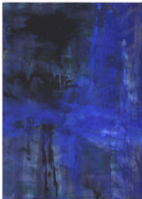
Beauty Without Regret, by Makoto Fujimura

For those who mourn, and those who would bear them up —in the hope of the Incarnation