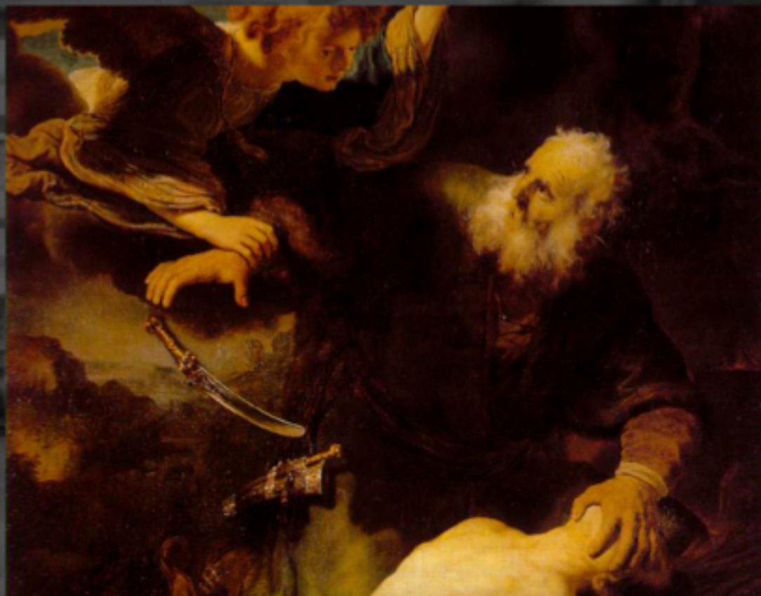
"Abraham and Isaac," Rembrandt, 1634