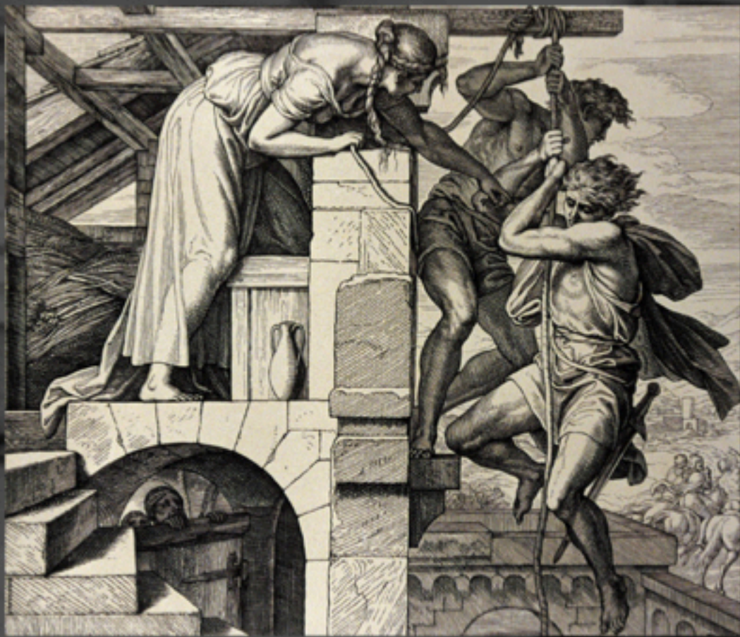
Rahab harbors the spies