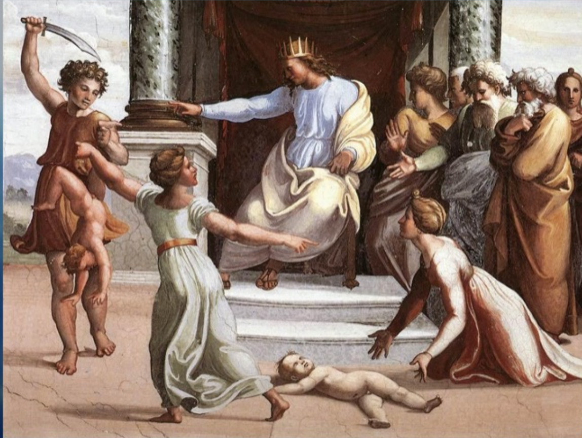
The Judgment of Solomon, Rafael (1519)