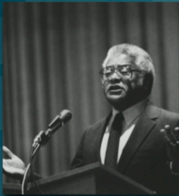
Rev. James Lawson

You have to keep in your mind an imagery of infinite possibility.