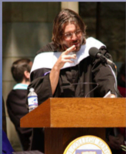
David Foster Wallace

The really important kind of freedom involves attention, and awareness, and discipline, and effort, and being able truly to care about other people and to sacrifice for them, over and over, in myriad petty little unsexy ways, every day. That is real freedom.