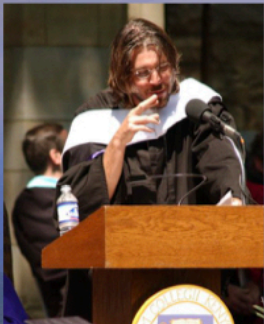
David Foster Wallace

There is no experience you've had that you were not at the absolute center of. [Consequently, our] natural, hard-wired default setting ... is to be deeply and literally self-centered, and to see and interpret everything through this lens of self. . . .