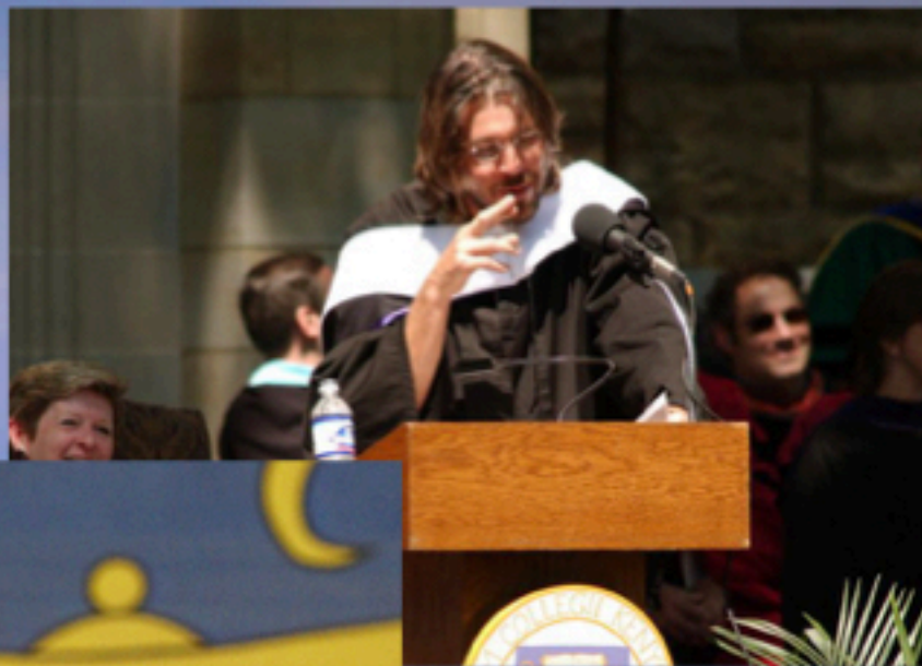
David Foster Wallace