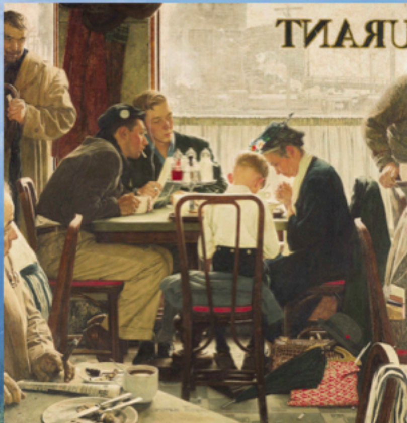
"Saying Grace," Normal Rockwell 1947