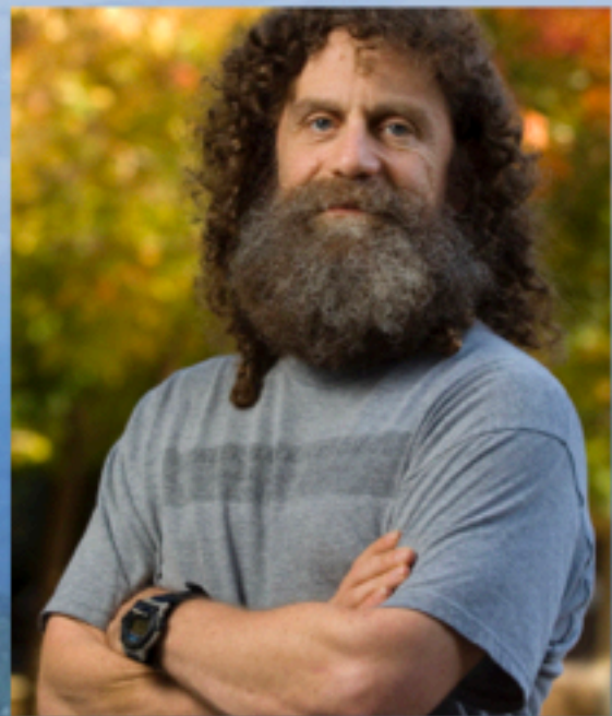
Dr. Robert Sapolsky

... people's most fundamental allegiance is to the familiar. Anything or anyone else is likely to be met, at least initially, with a measure of skepticism, fear, or hostility.