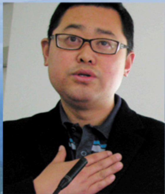
Pastor Wang Yi

...my disobedience is one part of the gospel commission. Christ's great commission requires of us great disobedience. The goal of disobedience is not to change the world but to testify about another world.