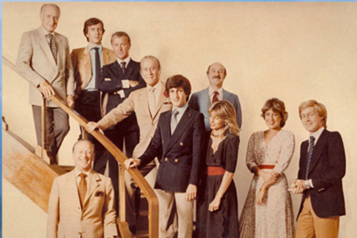
Gucci family, c. 1972