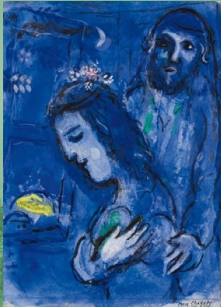
Abraham & Sarah, Marc Chagall