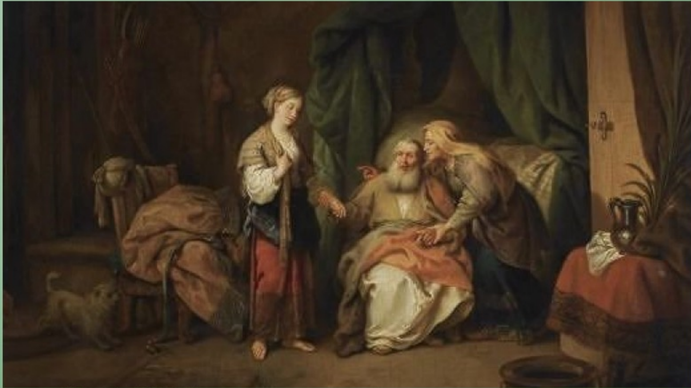
Sarah Offering Hagar To Abraham, Christian Wilhelm Ernst Dietrich