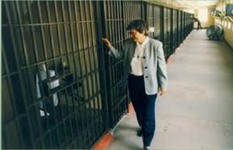
Sister Helen Jean Prejean

.. .the less forgiveable the sin, the more it must be forgiven; the less loveable the person, the more you must find the means to love them.