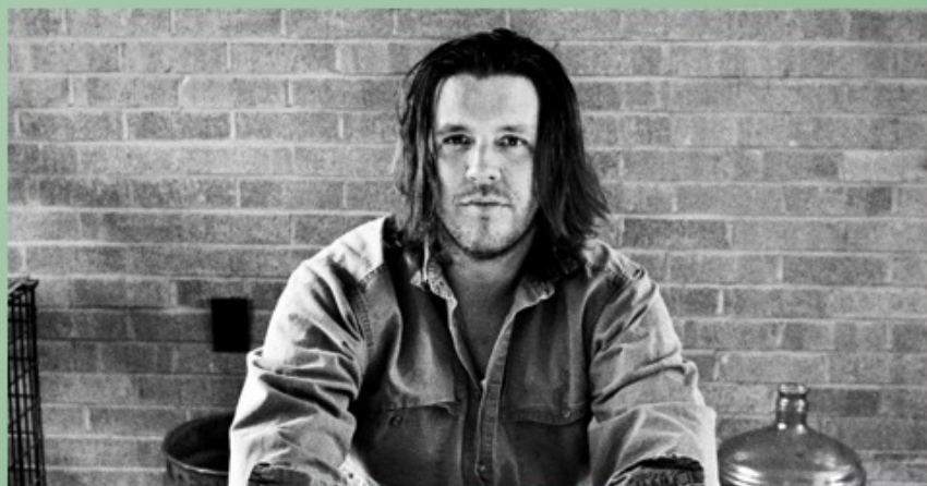
David Foster Wallace

Although it seemed a little bit simplistic to see this fear as just a male problem (try watching a girl stand on a scale sometime), it turns out that Dr. Gustafson was very nearly right in his concept of the two . . . . maybe the real root of my problem was not fraudulence but a basic inability to really love . . .