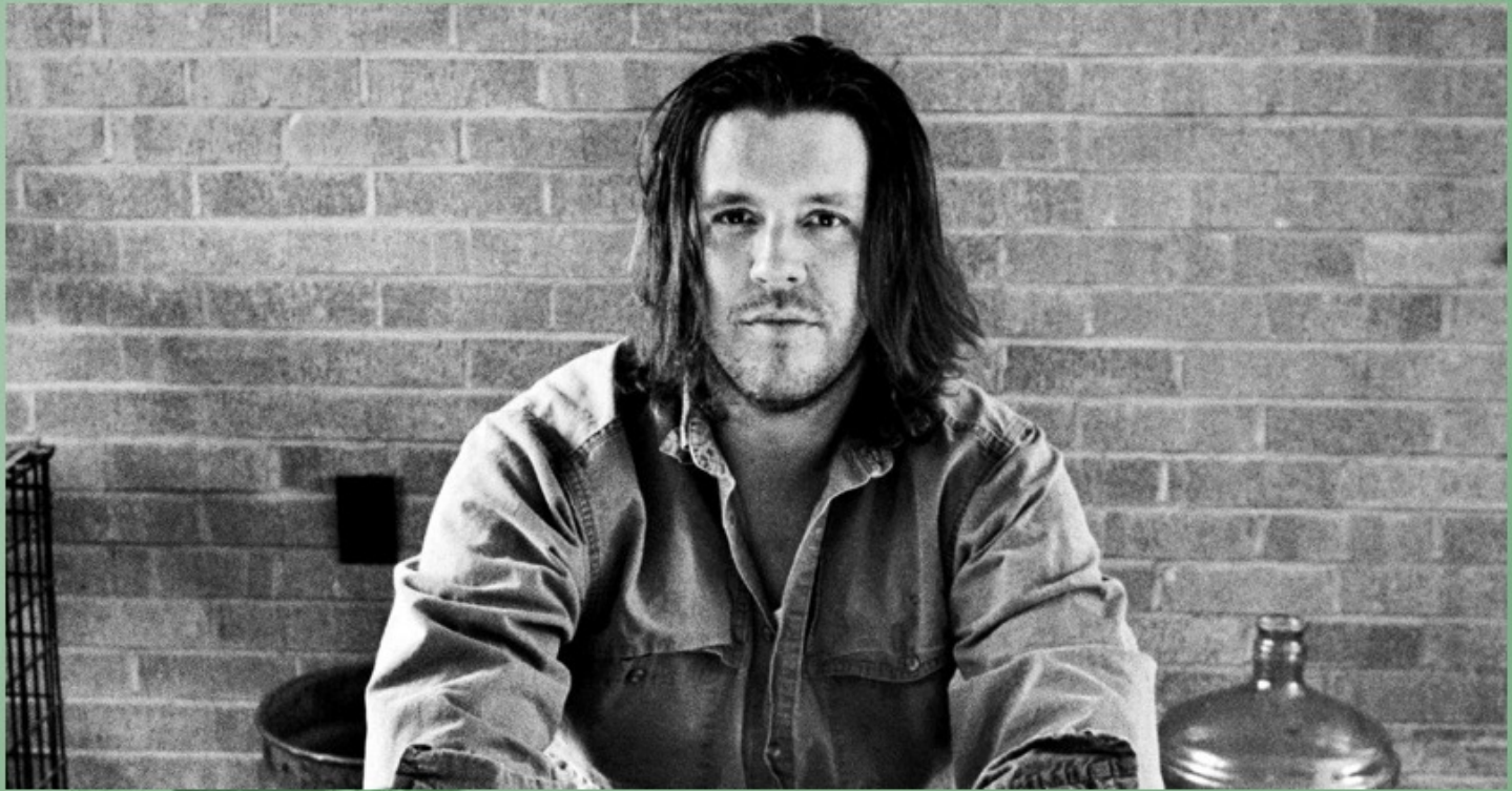
David Foster Wallace