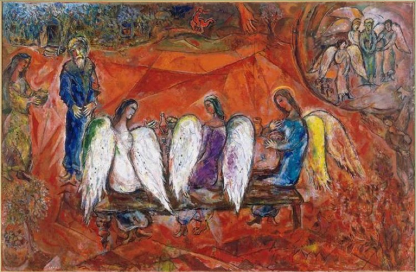
Abraham and three Angels Marc Chagall