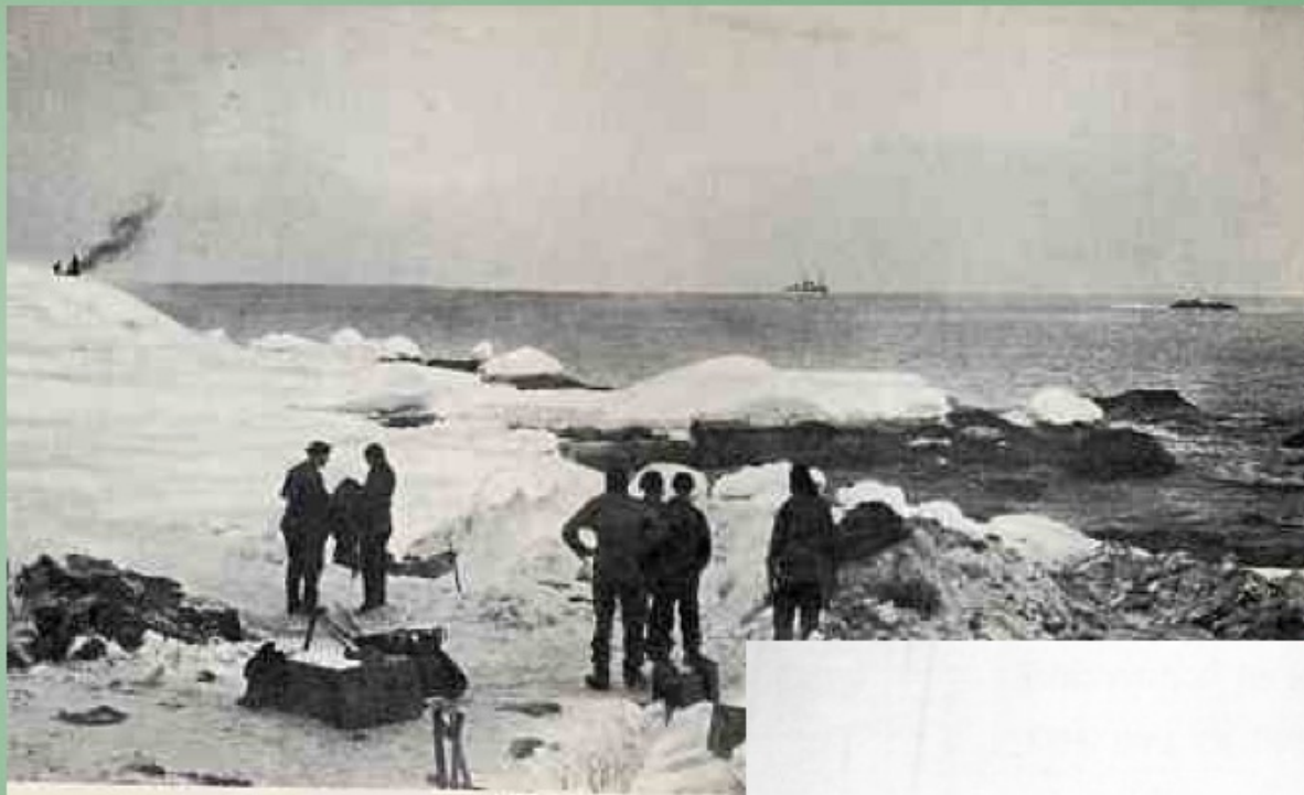
THE RESCUE SHIP SIGI "As we stood and gazed she seemed to turn away"