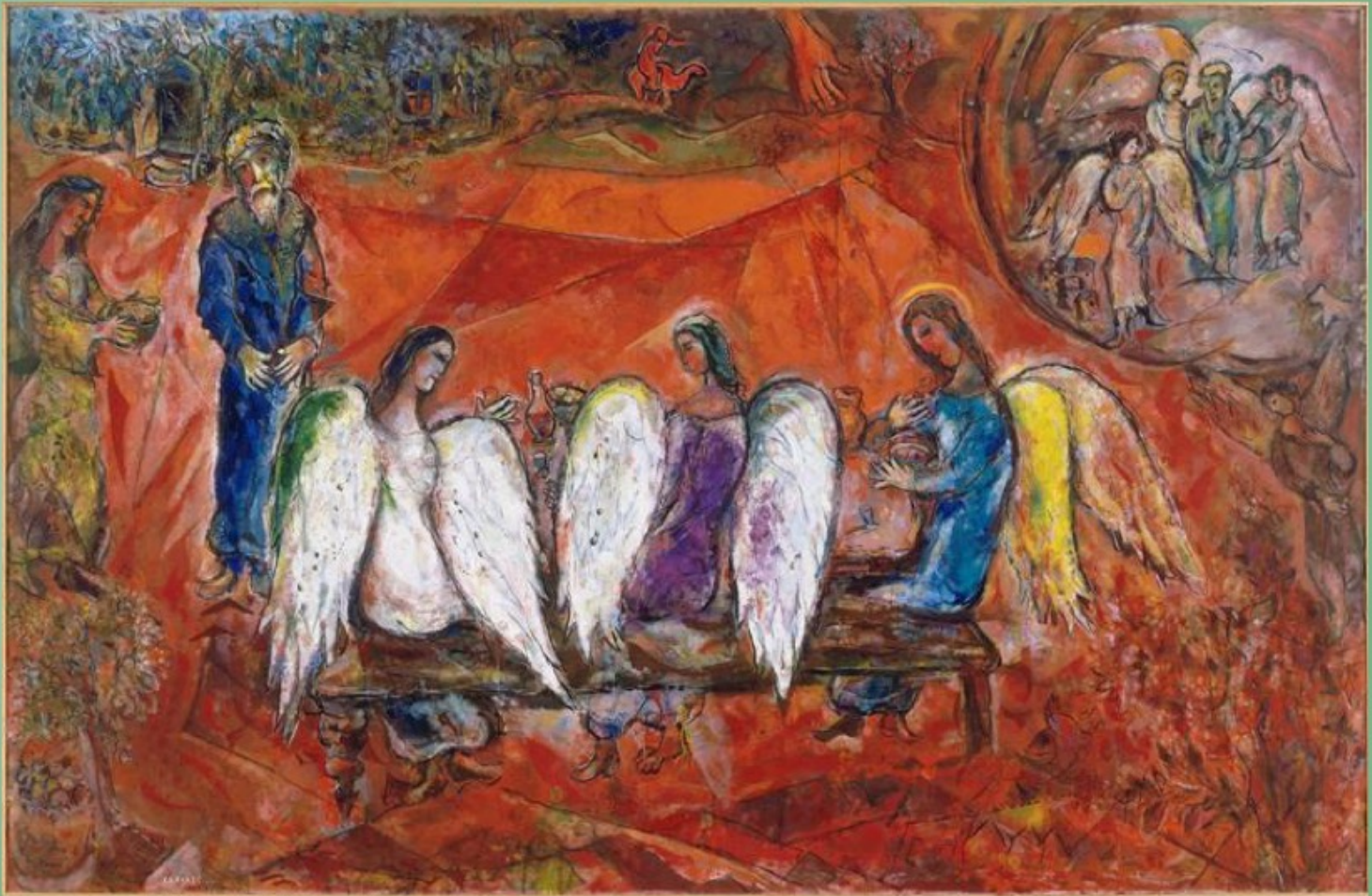
Abraham and three Angels Marc Chagall, 1966